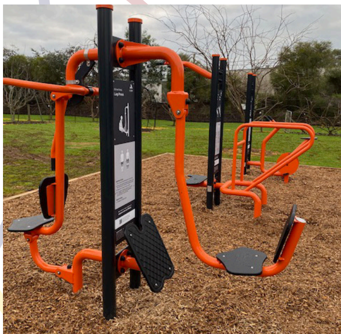
Above: The recently installed fitness equipment at the Borinya School, Wangaratta, with support from the Schools Plus organisation.

Two schools focused on creating safe and inviting play spaces for their students. St Andrews Public School NSW added a bike track which has improved positive play, social interaction and students' understanding of taking turns, while Spring Farm Public School NSW revamped a muddy, unused space to create an inviting play area which saw an immediate and significant increase in play and social activity amongst children in the school's support unit. "Students find the structured play area to be a place they could go at breaks when they felt overwhelmed."