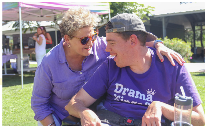
Top: The Sunshine Butterflies (Qld) enjoy outdoors playground time with facilities supplied by the PCA;