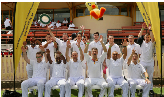
Above: The Vocus team enjoying another day at the office at North Sydney Oval;